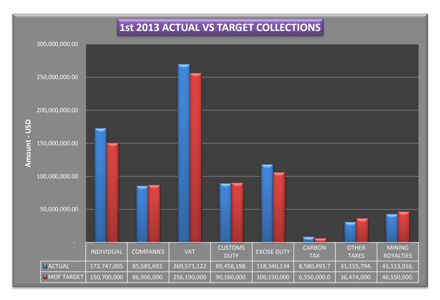
Fig 2: Revenue collection versus target