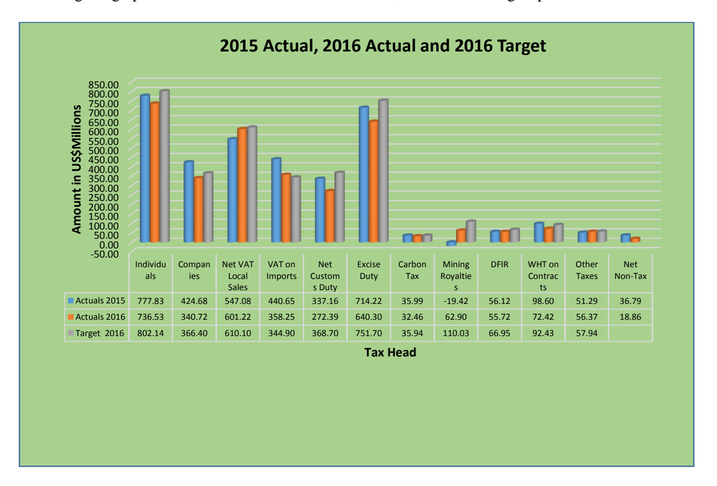
Figure 2: Annual Performance: 2015 Actual, 2016 Actual and 2016 Target

following bar graph shows collections for 2016 and 2015, and the 2016 targets per revenue head.