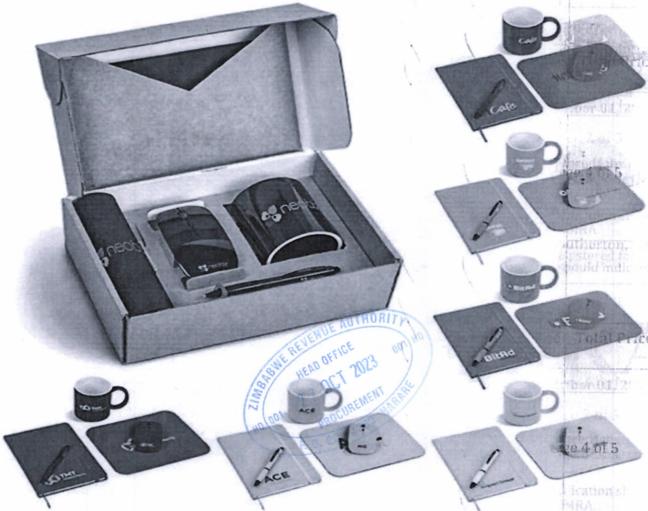
Image of the Branded All Star Omega Gift set

ZIMBABWE REVENUE AUTHORITY HEAD OFFICE OCT 2023 PROCUREMENT ZIMBABWE